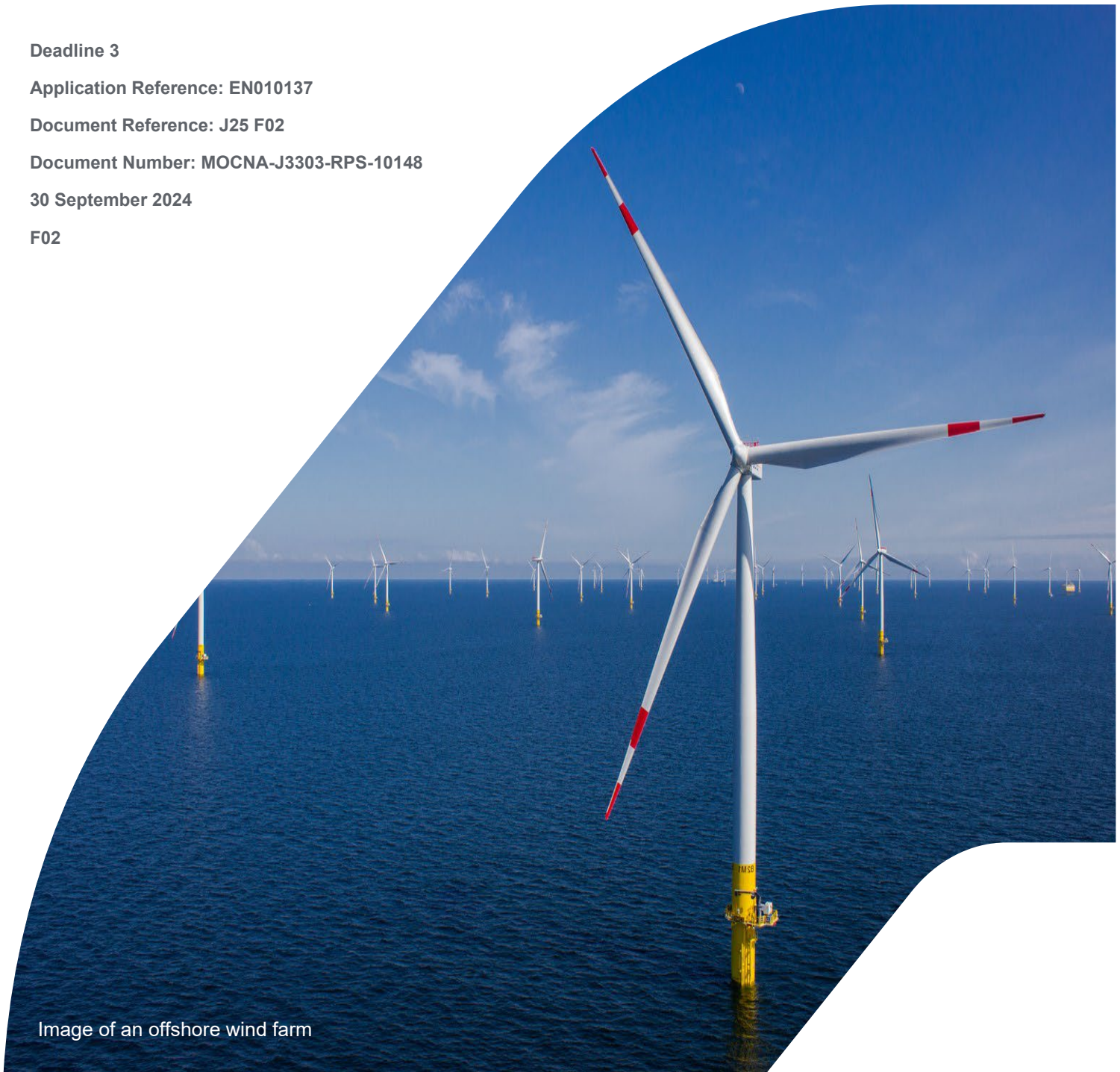
Image of an offshore wind farm